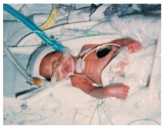
Alex, born at 24 weeks weighing 2 lbs., and at 6 months old.